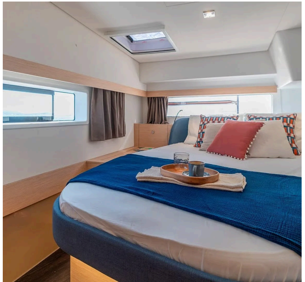
Fountaine Pajot Fp44 Simba, Model 2026