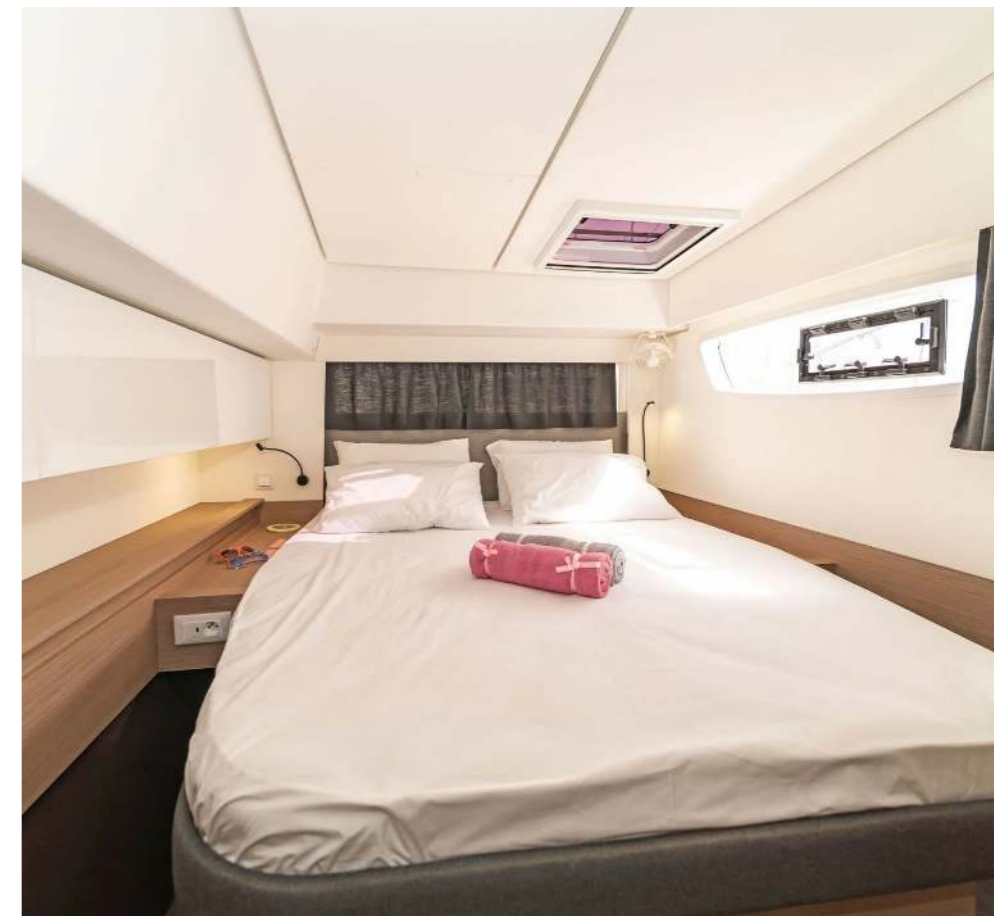
Elba 45 Fugu II, Model 2025