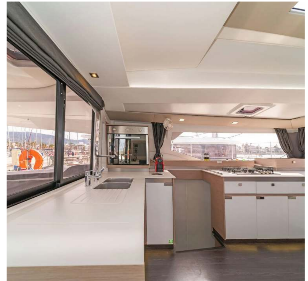
Elba 45 Fugu II, Model 2025